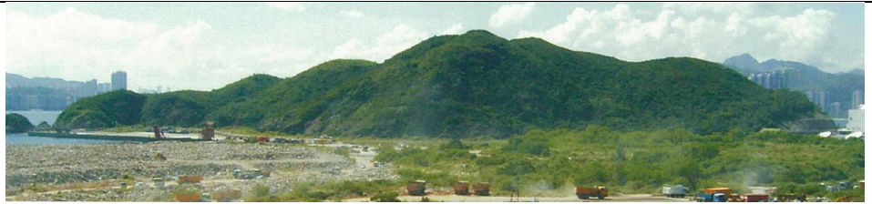
Fat Tong Chau Headland