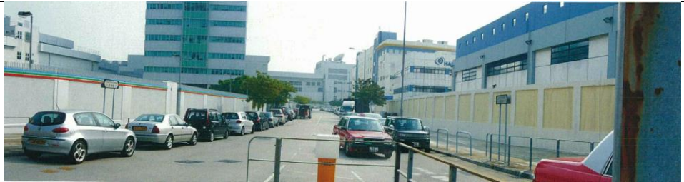
Tseung Kwan O Industrial Estate