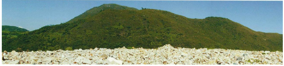
Clear Water Bay Peninsular Central Coastal Uplands