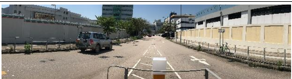
Tseung Kwan O Industrial Estate