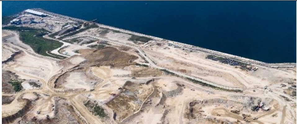
Fat Tong O Reclamation