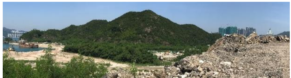
Fat Tong Chau Headland