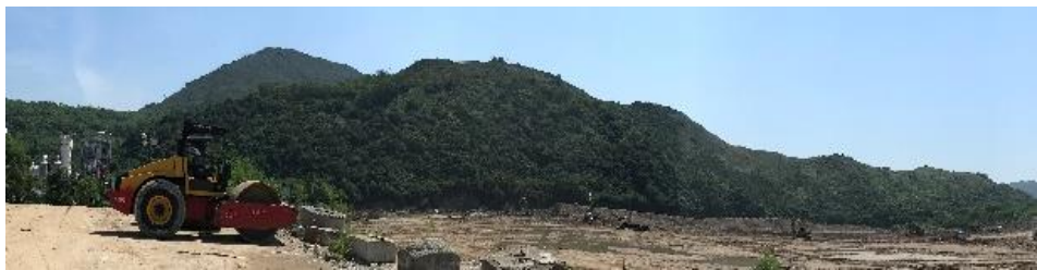
Clear Water Bay Peninsular Central Coastal Uplands